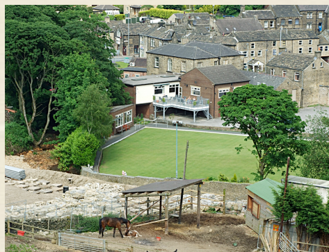
New Mill Club from the rear, overlooking the bowling green.

New Mill rehearses between 7.45 and 9.45 on Tuesday nights at New Mill Club.